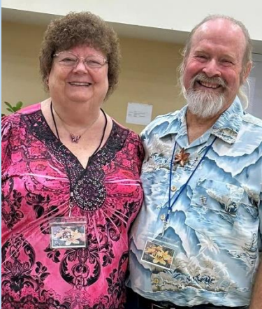
From September meeting. Thanks for the photos, Anita.