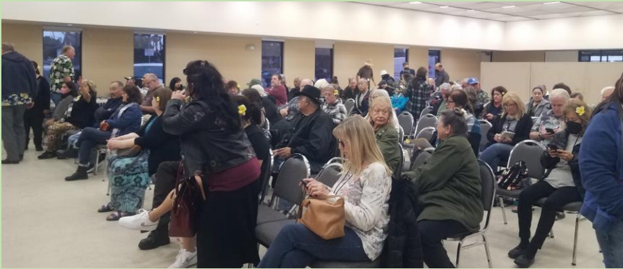
The Gang's all here!