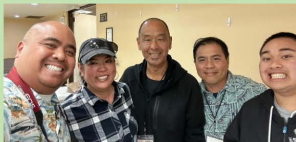
Fun with Friends

Orange County's Center for Plumeria Enjoyment www.southcoastplumeriasociety.club