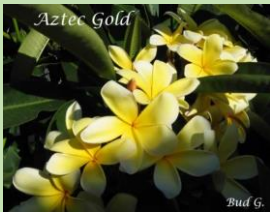
Aztec Gold from Bud's collection.

Orange County's Center for Plumeria Enjoyment www.southcoastplumeriasociety.club